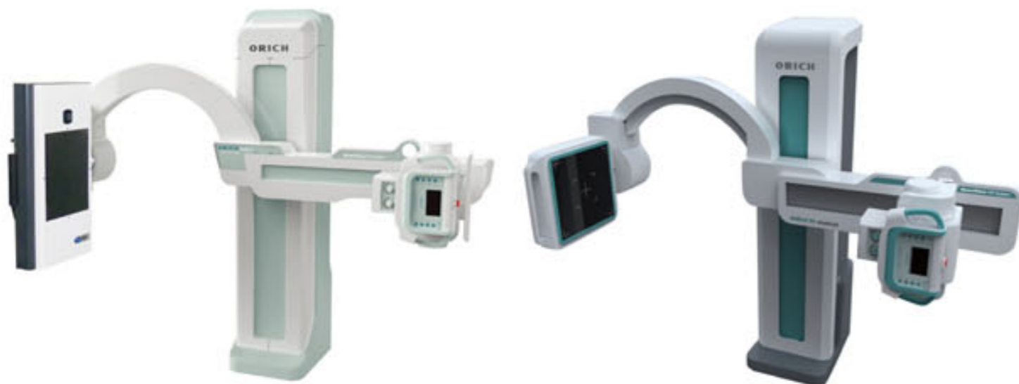
经济型平板 Economic flat panel detector