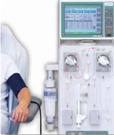
Active blood pressure measurement