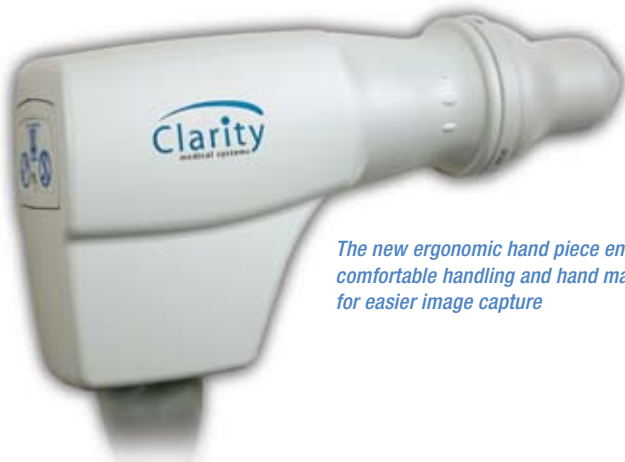
The new ergonomic hand piece enables comfortable handling and hand manipulation for easier image capture