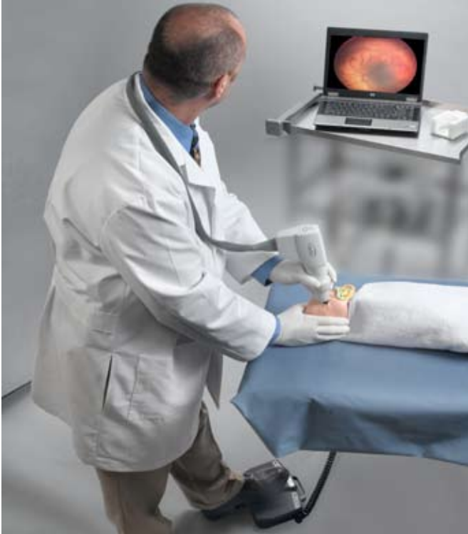
The RetCam Portable system is easily assembled on a cart or table for ophthalmic imaging at any location