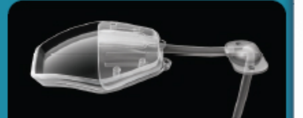
Model PS3 Model S3 with Pars Plana Clip™