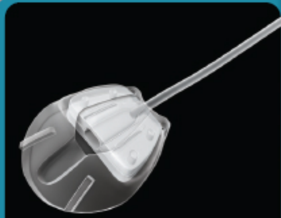
Model FP8 Ahmed™ Glaucoma Valve Flexible Plate™ (Pediatric)