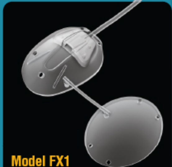
Model FX1 Flexible Bi-Plate™