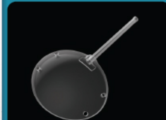
Model B4 Non-Valved Plate