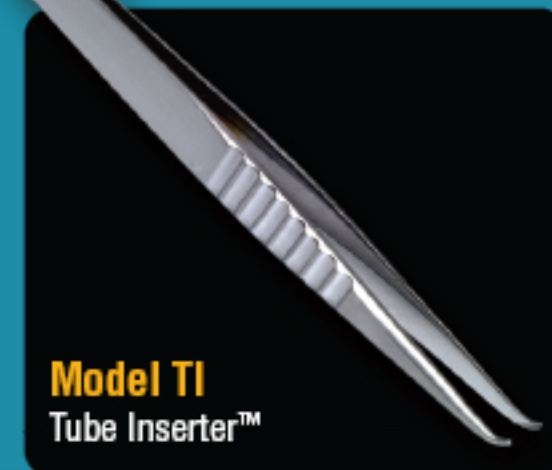
Model TI Tube Inserter™