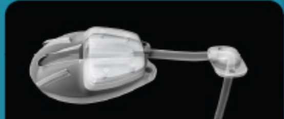
Model PC8 Model FP8 with Pars Plana Clip™