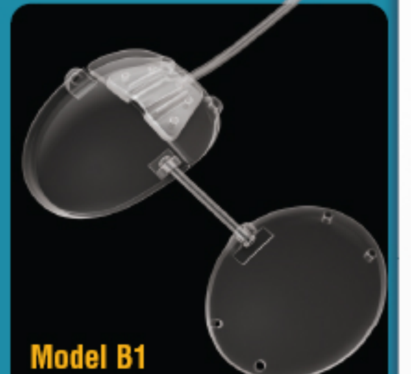
Model B1 Bi-Plate™