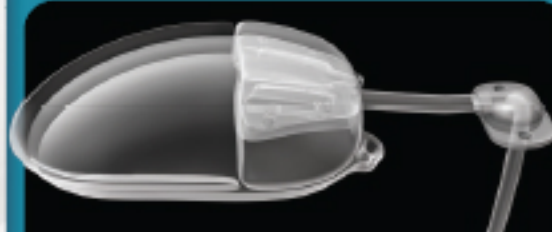
Model PS2 Model S2 with Pars Plana Clip™