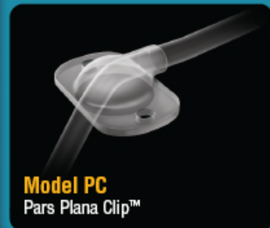
Model PC Pars Plana Clip™