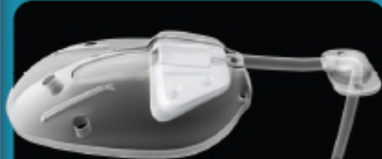
Model PC7 Model FP7 with Pars Plana Clip™