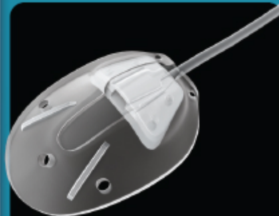
Model FP7 Ahmed™ Glaucoma Valve Flexible Plate™