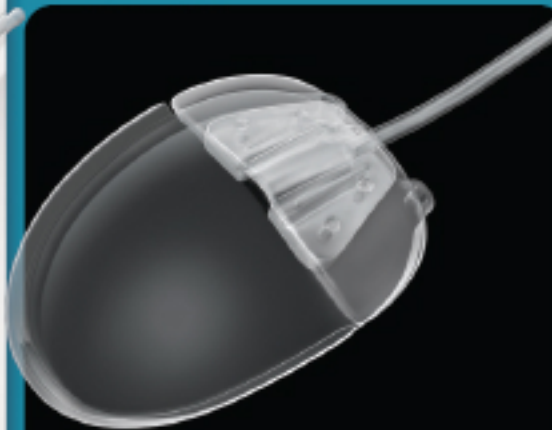
Model S2 Ahmed™ Glaucoma Valve