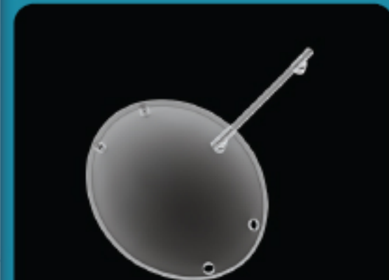
Model FX4 Flexible, Non-Valved Plate