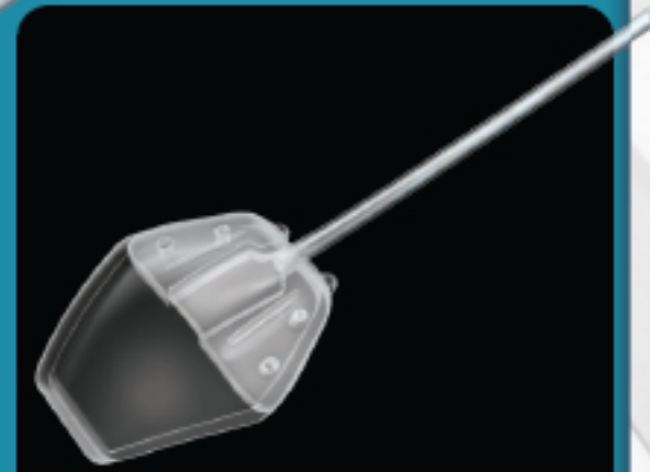
Model S3 Ahmed™ Glaucoma Valve (Pediatric)