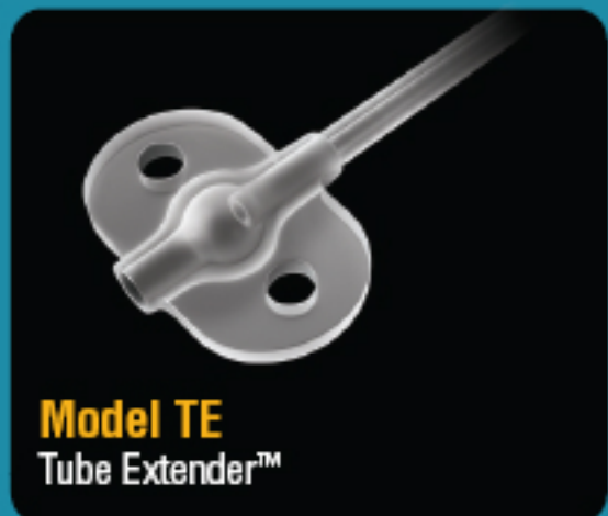
Model TE Tube Extender™